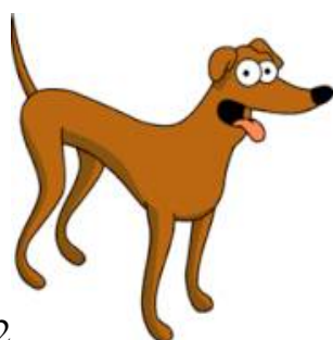
12 rubbish at racing