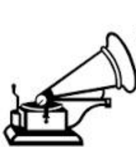
10 good listener