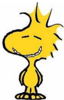
1 Likes music festivals