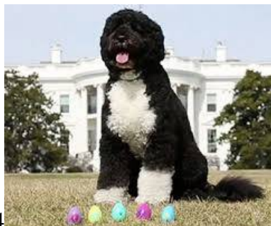
14 dug up Whitehouse lawn