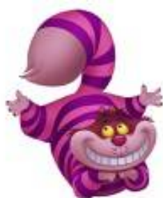
2 likes his dentist