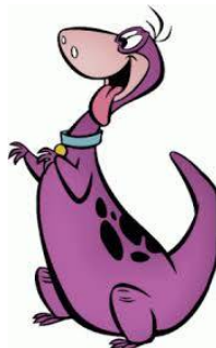
3 likes Fred