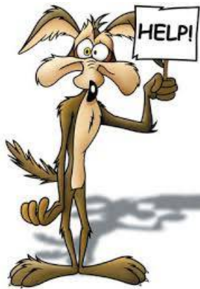
6 evil "genius"