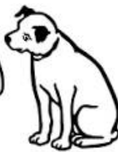
11 oh no no no no