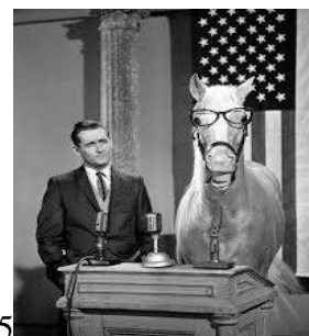
15 won't shut up