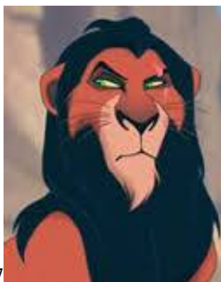
7 just evil