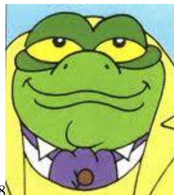
8 evil that needs Strepsils