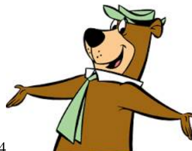
4 likes Cindy.....