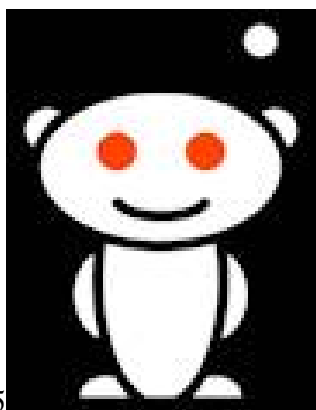
5 Social media website