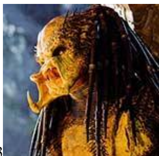
13 rubbish at beauty contests