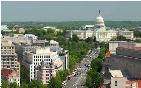
8 Presidential Street ....