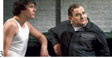
3 Breakfast TV???