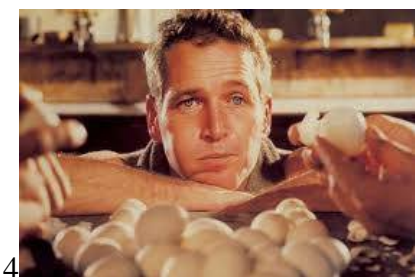
14 Actor with cool hands