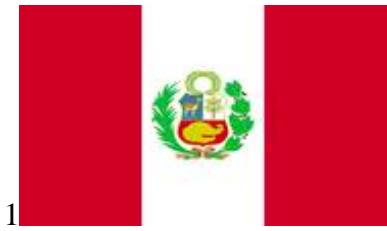
1 Paddington's country

Same format as the verbal questions, all start with a P... ignore the first "a" or "the"