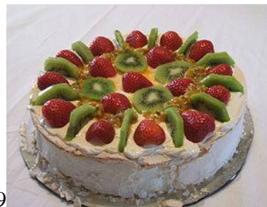
9 A ballet dancer's dessert