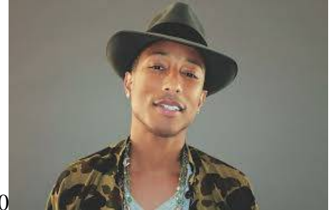
10 very "Happy" singer