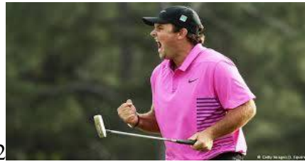
2 master of The Masters