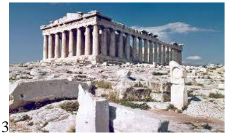
13 just needs a bit of pointing