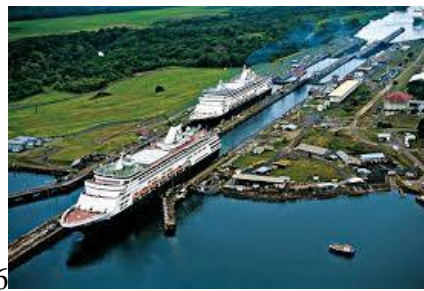
6 part of the .....