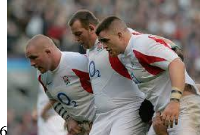
16 the two either side of the hooker