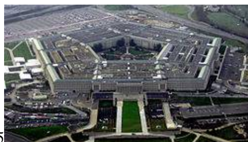
15 World's largest office building