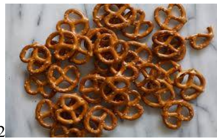
12 George W. Bush's favourite...