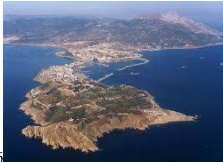
6 The Spanish Gibraltar???