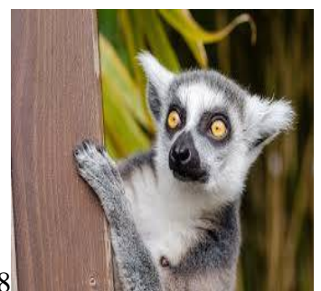
8 Only in Madagascar...