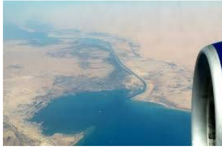
2 aerial view of the....