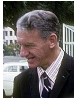
7 Ruled Rhodesia