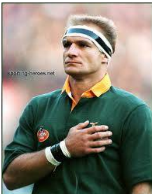
13 S. Africa Captain when they won 1995 World Cup