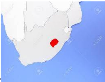
9 Surrounded by South Africa