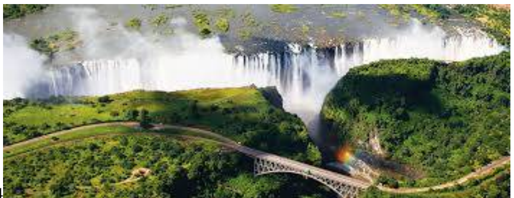
14 Where in the World???