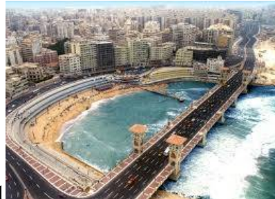
11 big lighthouse, bigger library (city)