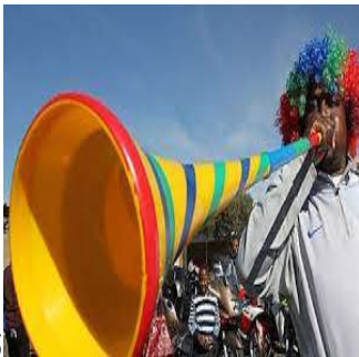
5 Musical bliss???