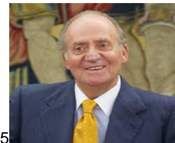
Head of the family .....