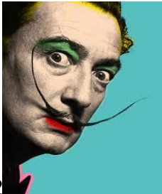
got two points