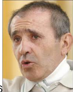
named a trophy