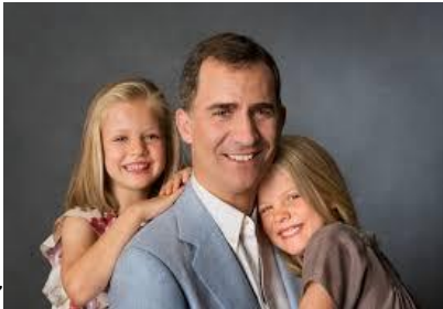
He THINKS he's the boss