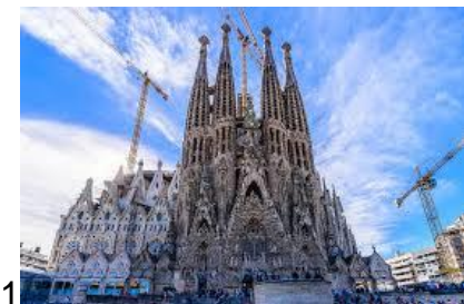
Needs a bit of pointing