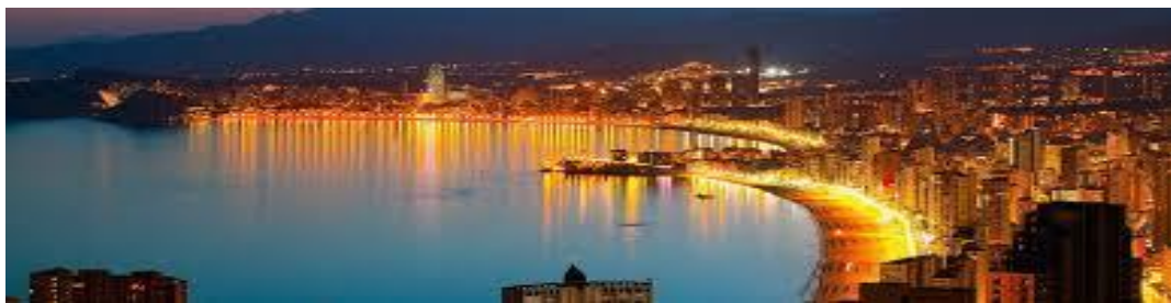
Where Johnny Vegas THINKS he's the quiz champion .....