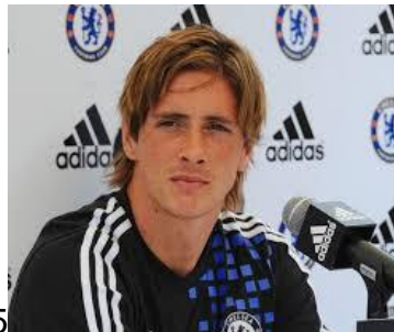
Left Liverpool to win stuff