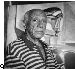
Stripes and cubes