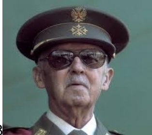
He WAS the boss