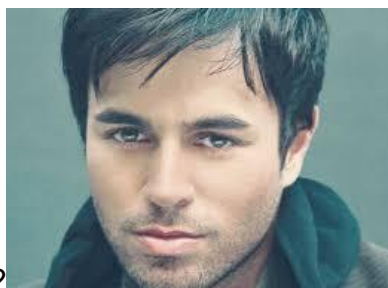
He sings like his Dad