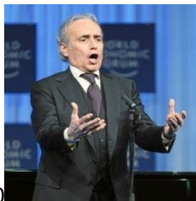
Worth a Tenor.....