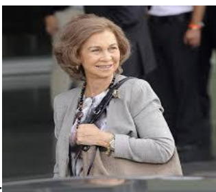
But SHE'S the boss