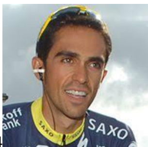
won Tour in '07 & '09