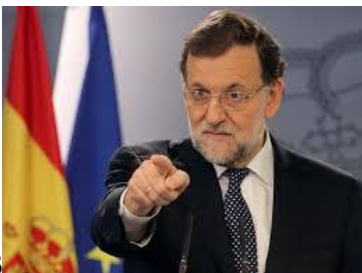
making his point