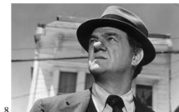
8 Played on the Streets of San Francisco