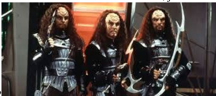
2 Played on the starboard bow