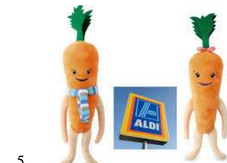
5 Played with each other..... 1pt each