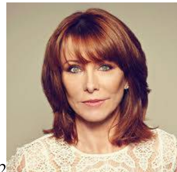
12 And here's the news...