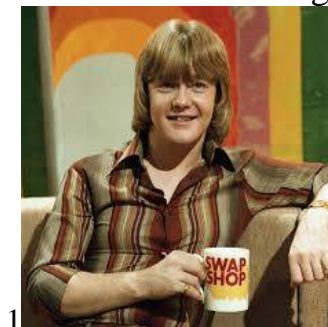
1 Played Pop