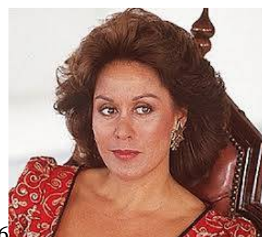
6 Played the Albert Hall... what a Dame