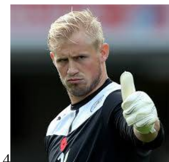
4 Played well