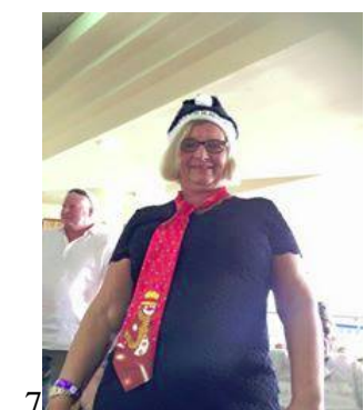
7 Plays Bingo