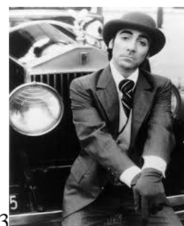
3 Played drums