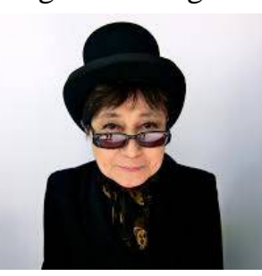
Had a plastic band