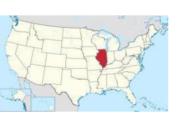
The Land of Lincoln