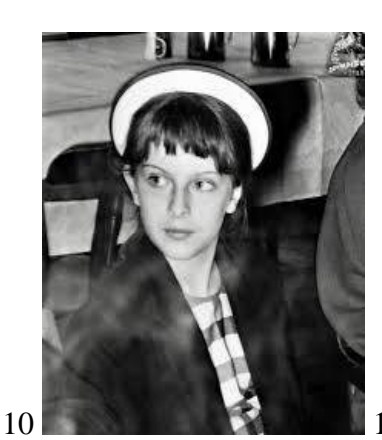
Rt Hon Member for Maidenhead