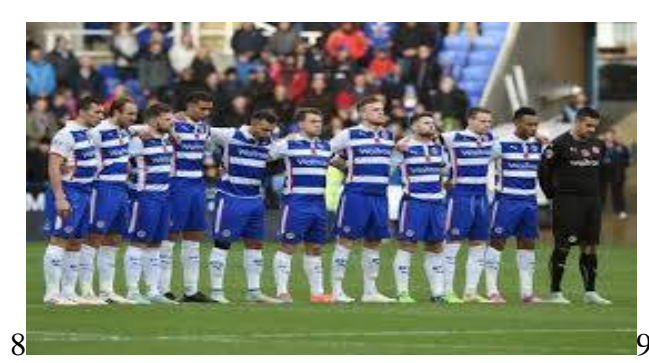
Hardly a Madejskic team....