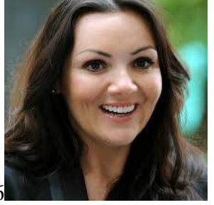
had a Perfect Moment