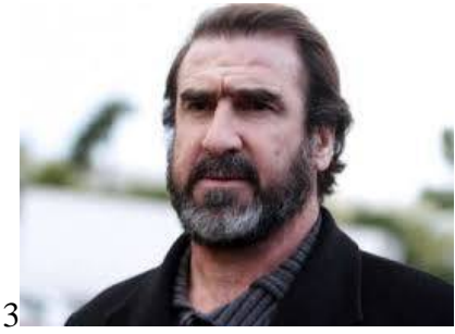
Had seagulls following his trawler