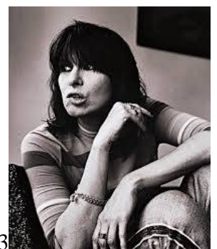
13 had some brass