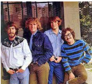
11 Liquid awakening...