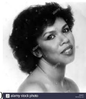
10 Young heart ran free