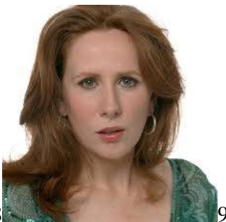
8 TV star