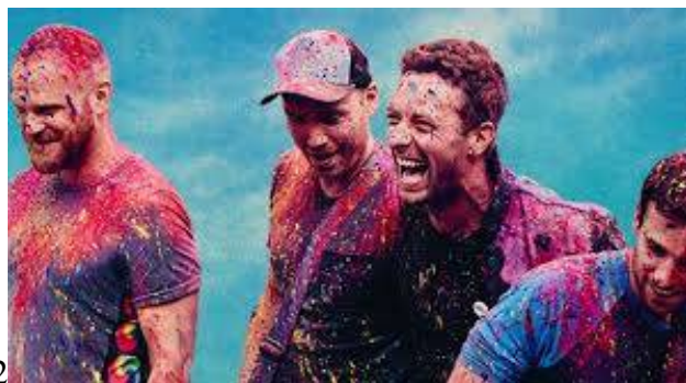
12 very chilled band