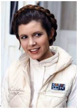
4 Star Actress