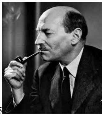
5 post war politician