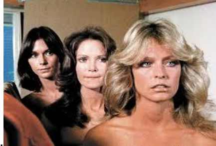
7. 70's culture