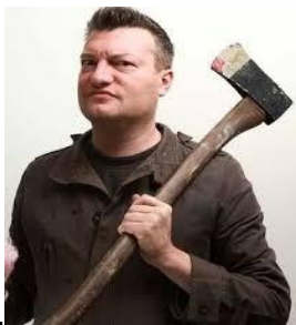
5. Cutting remarks