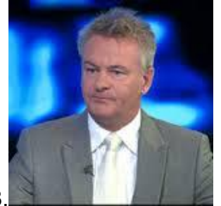
8. The Champagne one