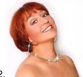
12. loved to love