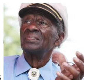
16. You Never Can Tell