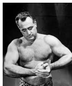
19. Knows where to go