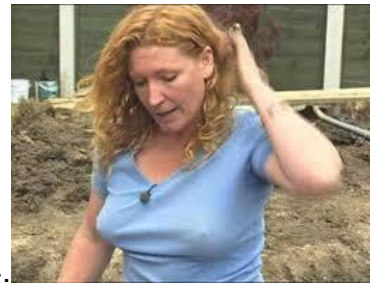
4. just digging around