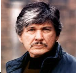
6. Majestyk actor