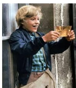
18. Yay! Found it!