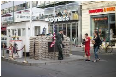
9. Check this out