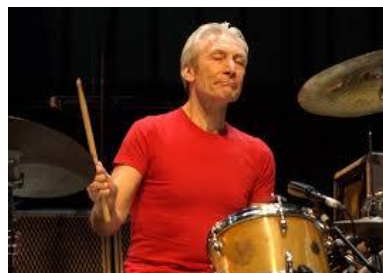
14. just rolls along