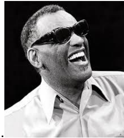
3. What he says