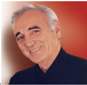
1. Aaah ... She....