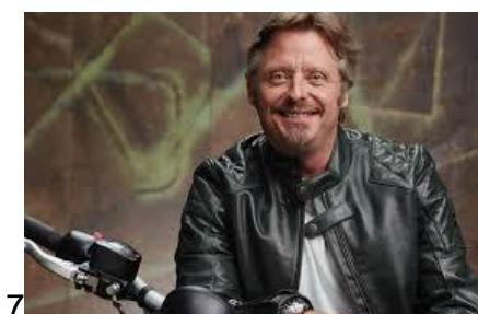
17. Ewans mate, went long way round