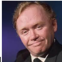
11. Hallo my darlings