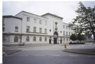
10. looks in good nick