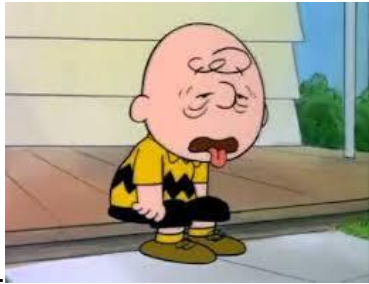
2. What's the matter?