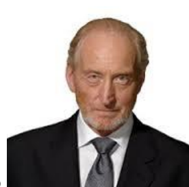
15. not quite in Darkness