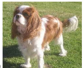
20. It's a dogs life