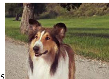
15 What? little Johnny fell down the old mine shaft, broke his leg, lost his phone, and wants his dinner?