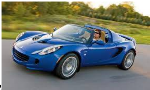
2 blooming fast