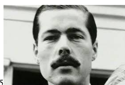
5 still lookin' .....