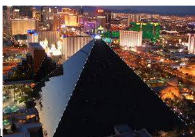
14 Best steaks in Las Vegas