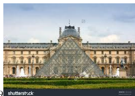
9 Very artistic