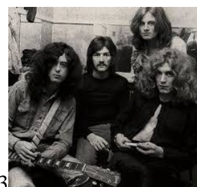
13 HEAVY rockers