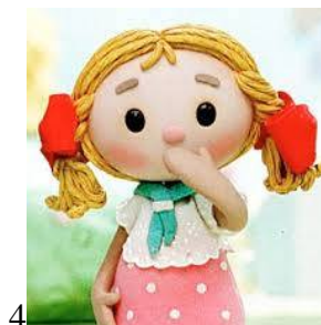
4 Very 'andy...