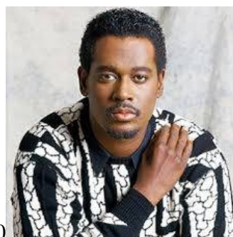
10 Endless Love with Mariah