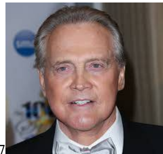
7 worth £4,808,771 and 20p