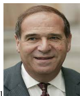
11 Baron Spennithorne