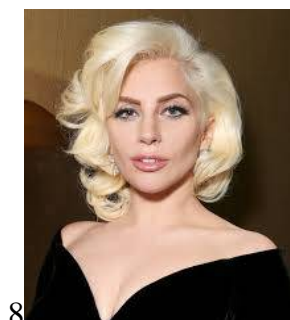
8 Born this way