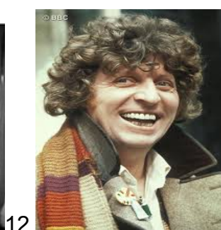
Had a scarf