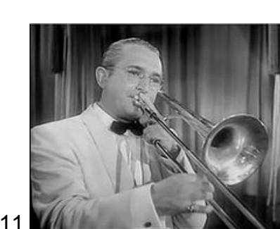
Had a Big Band