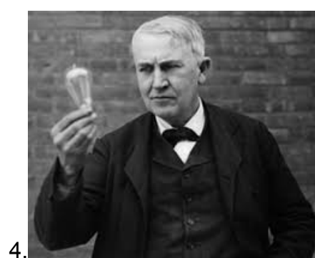
No trouble with the dark