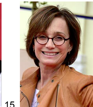
An English Patient in Gosford Park?