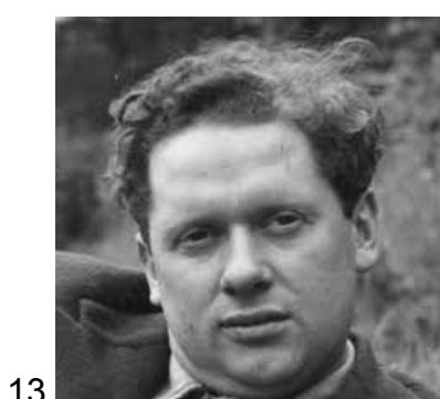
Welshman under milk wood