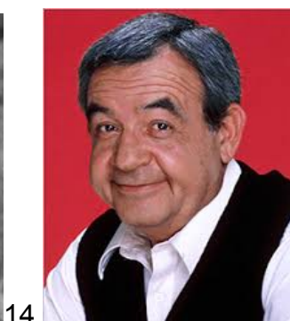
Oh Happy Days