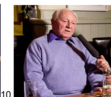
Had clubs... lots of clubs